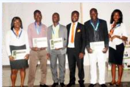
Recognitions of Supervisors