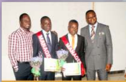
Recognition of Managers