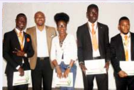
Recognitions of Assistant Managers