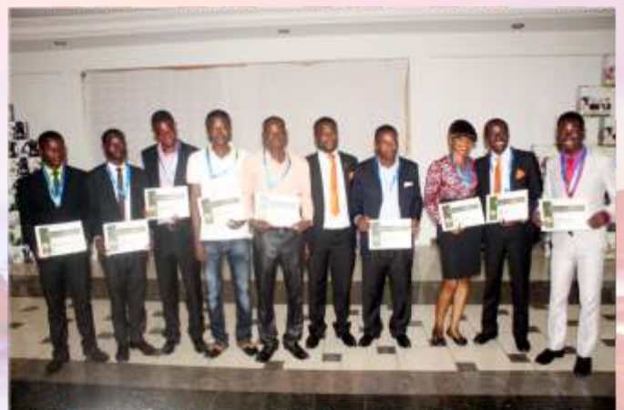
Recognitions of Supervisors