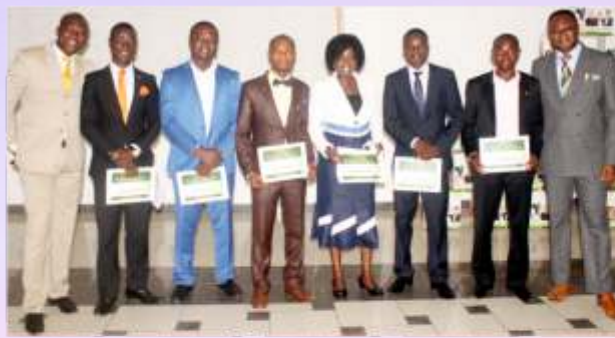
Recognition of Top Business Builder's