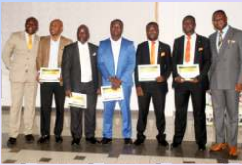
Recognition of Top FBO's