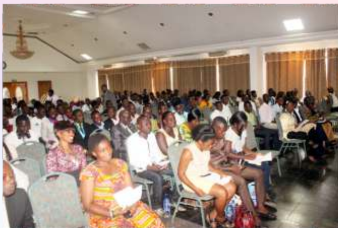
Cross section of the audience