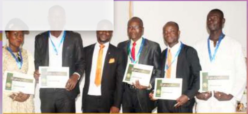
Recognition of Supervisors