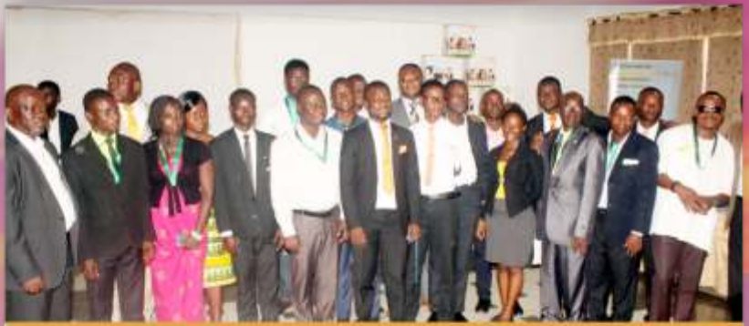
Recognition of Assistant Supervisors