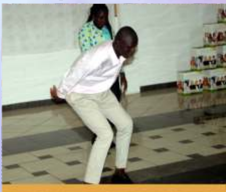
'FIT boogie down Dance Challenge'