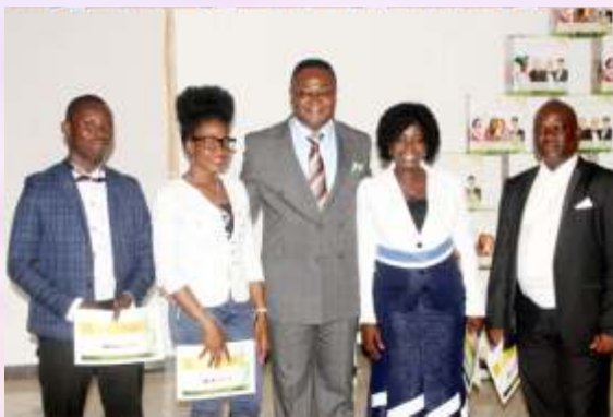
Recognitions of Top Retailers