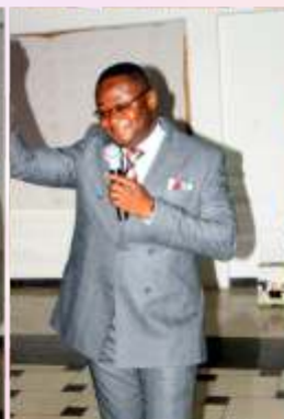
Country Manager dancing to the tune "We Would Rock You"