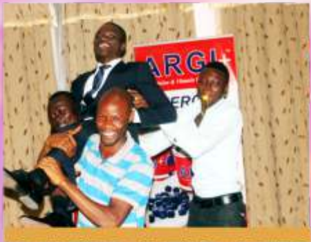
BR Team members showing joy and support after a team member is recognized Manager