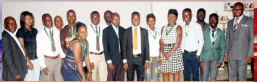
Recognition of Supervisors