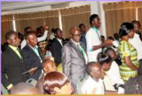
The audience was not left out of the FUN

at Miklin Hotel Kumasi 28th November, 2015